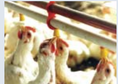
Organic acids can be provided in drinking water, providing health benefits for birds while helping to kill pipeline bacteria

water is often a source of contamination to the animals.