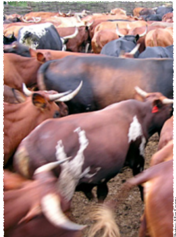
The picture on the left shows livestock, accompanied by herders, soon after they were brought to the demonstration site and planned grazing began. The picture on the right shows the improved condition of livestock after one year of planned grazing.