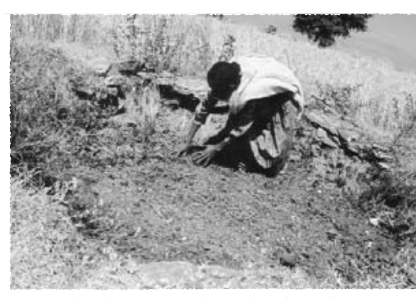
A woman working in her compost pit in Zeban Sas.

The project offers a range of choices and farmers adopt those that suit their ecological and social setting. Experience has shown that each village has a preference for one or two of the different components of the project. At Zeban Sas, the emphasis has been on soil and water conservation, because the area was badly affected by soil degradation. At Gu'emse and Adibo Mossa farmers adopted composting rapidly, because there was already sufficient plant material and animal manure for making this natural fertiliser.