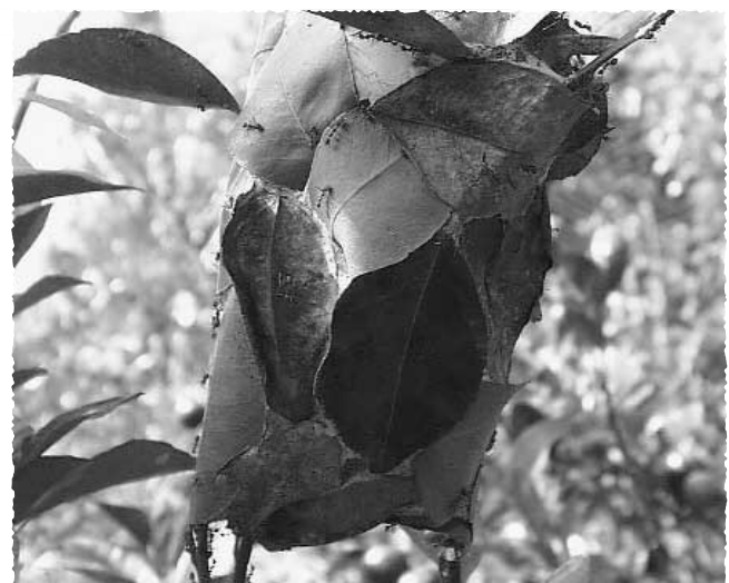
Weaver ant nest in pomelo.