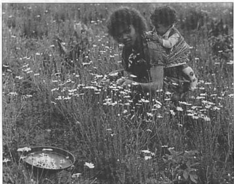
Gathering pyrethrum flowers

Farming Systems Kenya, an NGO, and farmers have been experimenting over the last six years with the use of pyrethrum marc to control maize stem-borers, one of the most important pests of Kenya's staple