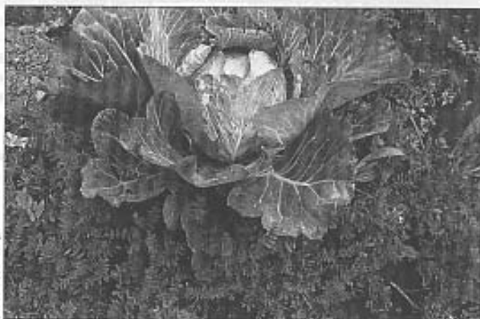
Cabbage growing with vetch-undersowing ( Vicia villosa ) in an organic farm in Riobamba, Ecuador.

Albrecht Benzing, Sufetenstrasse 13, 37213 Witzenzhausen, Germany.