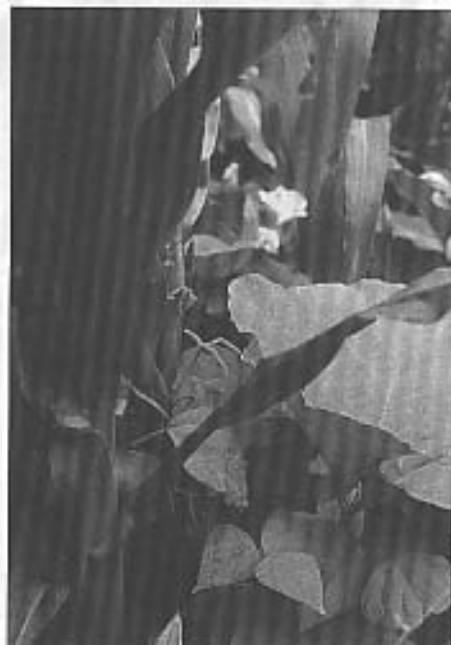
A traditional corn-bean-cucumber mixed cropping system in the Ecuadorian Andes. Soil covering helps to conserve fertility.

The integration of elements found in the farming systems described above combined with new insights could offer a solution to the problem of sustainability. Very little advantage is being taken of this potential at the moment and it should be explored. First, the integration of agriculture and animal husbandry is part of peasant farming systems in the region. This can be considerably intensified by reducing grazing on natural pastures, growing fodder shrubs and undersowing main crops with fodder legumes. Second, in intensive irrigated systems, an alfalfa-grass-ley combination would help build up the level of organic matter in the soil more effectively than the traditional system of growing alfalfa as a row crop and hoeing it in after every harvest. This would let humus build up in the soil. However, care should be taken that kikuyu ( Pennisetum clandestinum ) is not allowed to invade the fields too much. Two years seem to be a reasonable time. Third, mixed cropping, as practised by small corn growers, mostly in dryland farming appears to be a good way of conserving soil fertility, especially when one or more legumes are included. Ways of covering the soil as soon as possible after planting and keeping it