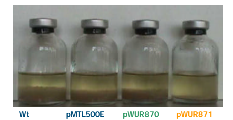
Fig. 2 Cultures of C. beijerinckii wild type (wt) and transformants on basal medium with lichenan at 2% (w/v).

The final objective is to provide biodiesel at a cost between fossil diesel and FAME, i.e. \in 250-500/m<sup>3</sup>.