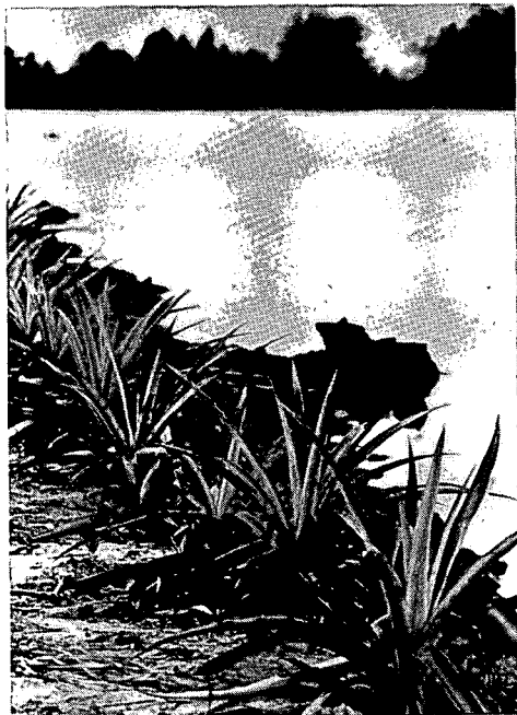
Figure 3. Pineapples growing on a long established dike of a brackish water fishpond in an acid sulfate area

Weeds will start to cover the dikes, protecting them against erosion by rain, or grass can be planted to speed up the revegetation. Alternatively, pineapples can be planted on the dikes to provide more cash income. This was successfully practised in one location (Figure 3).