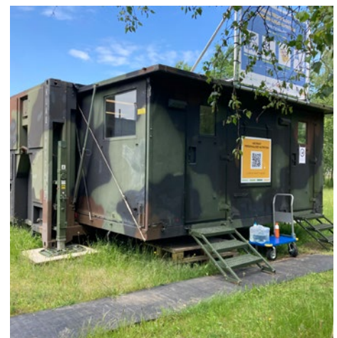
The Military Mobile Satellite Kitchen from the outside.