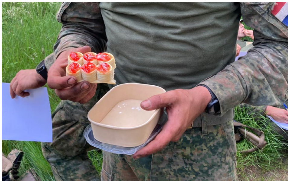
This soldier has already taken a few bites from his personalized snack.

as any gastro-intestinal issues and the amount of physical exertion expected of them. So the composition of the snacks is different for each person and we think this will enable us to improve their health and performance with precision.' While Noort is explaining the philosophy behind the personalized nutrition, the gripper continuously moves the little trays between the seven stations the installation is made up of. The first production station makes the cups, the outside layer of the Nutri-Bite. Hanging in this machine are six spouts with different kinds of dough, which print four