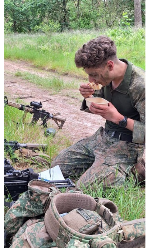
A soldier takes a break to eat his personalized snack.

This study is supported by the public-private partnership IMAGINE and co-financed by the Dutch ministry of Economic Affairs through the Life Sciences & Health Top Sector (WUR and TNO) and the High Tech Systems and Materials Top Sector (TNO). The private partners involved are the GEA Group, SoliPharma BV, Tate & Lyle, Nissin, General Mills, the Gelderse Vallei hospital and the Dutch ministry of Defence.