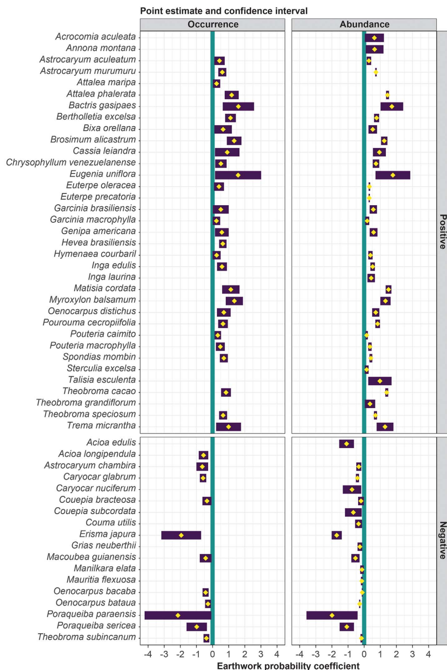
Fig. 3. Significant relationships between the occurrence and abundance of domesticated tree species and the modeled distribution of earthworks in Amazonia. Point estimates and confidence intervals of species significantly associated with predicted probability of earthwork presence, with an overall significance level of 5%. Positive species are more likely to occur and be abundant where predicted probability of earthwork presence is high, whereas negative species are less likely to occur and be abundant there.

covariates were used to describe the dataset sample preference by indicating the most favorable location for sample acquisition (32). The effect of sample selection bias was individually weighted for each sample (21).