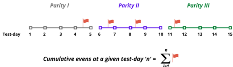
Figure 1. Example of mastitis events calculation for a given test-day record along a cow's lifespan.