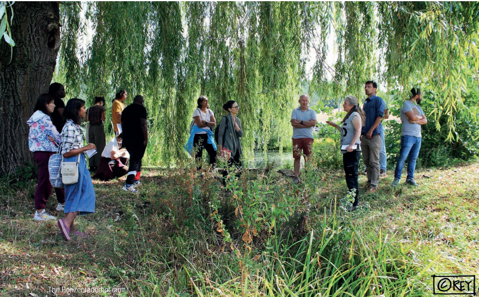
The Benzenraderhof farm