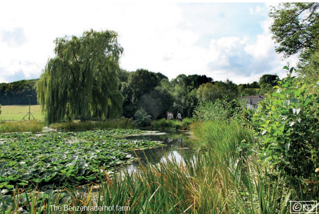
The Benzenraderhof farm