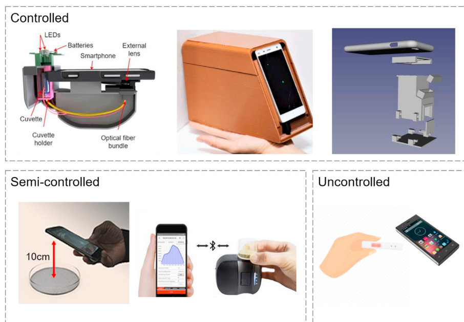
Fig. 2. Overview of three types of scene backgrounds during acquisition, i.e., uncontrolled, semi-controlled, and controlled conditions, with examples for each type. Reprinted with permission from Refs. [39,54,57,67,72].

smartphone's ALS with a microplate for measuring transmitted light intensity in ELISA measurements. The results from the SbS colorimetric reader were consistent with laboratory-based microplate readers, and the attachment is compatible with different smartphone models [76].