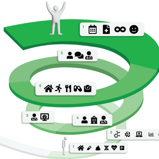
FIGURE 1 Conceptual schematic of the current nonpersonalized state of healthcare that focuses on population-based approaches to treating symptoms, and a vision for a future state of healthcare that leverages personalized data (e.g., microbiomes, dietary intake, genomes, blood analytes, etc.) to inform precision interventions (e.g., combinations of prebiotic, probiotic, lifestyle, dietary, or clinical regimes) aimed at addressing the root causes of illness to improve health and well-being.