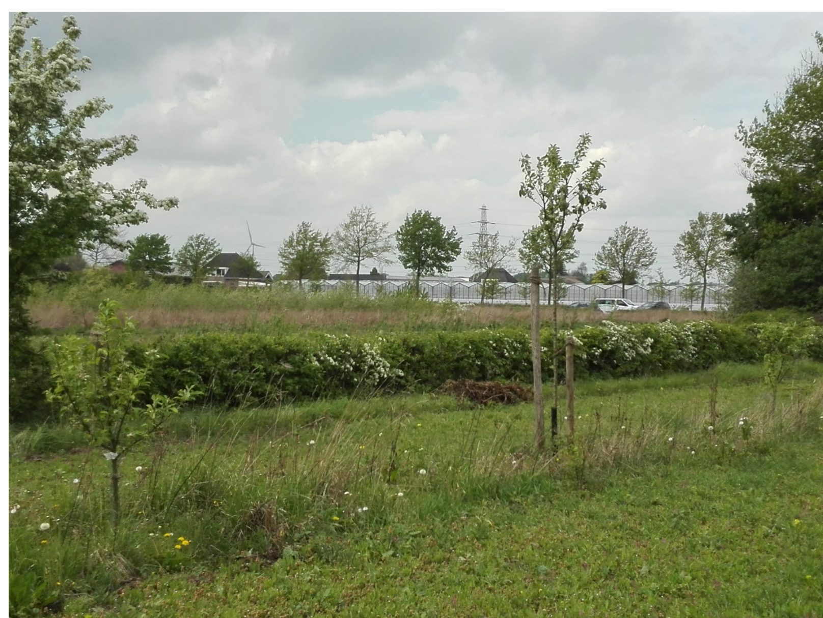
An example of alley cropping at the village of Bemmel