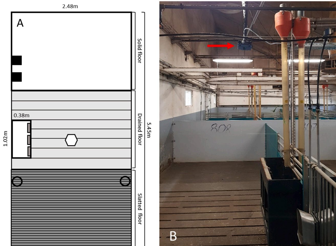
Fig. 2. (A) Illustration of the pen for fattening pigs on Farm 2. Feeders with three partitions are represented by the white rectangles, the iDOL65 3D camera by the white pentagon, drinking cups by the black hollow circles, and the two solid black squares represent two hard wooden sticks in separate vertical racks provided as general enrichment for all pens (retrieved from Larsen et al., 2018). (B) Illustration of the pen with the depth camera installed above the multi-partitioned feeder and indicated by the red arrow (credit: Guilherme A. Franchi).

proposed by Flegal et al. [20], a 95% Limits of Agreement (95%LoA) of 10% of the median scale-based BW [21] over the fattening period of each farm population (Farm 1: \pm 8.8 kg; Farm 2: \pm 5.5 kg) was pre-specified as an acceptable degree of agreement between the two measurements. The normal distribution of the number of individual daily images and BW estimation variation were graphically confirmed with a histogram and QQ-plot. The camera's BW estimation error (Root Mean Square Error; RMSE) at individual and pen level was assessed with mixed-effects linear regression (library glmmTMB v.1.1.2; [22]). The individual-level model included estimated BW as outcome variable, the scale-based BW, day and their 2-way interaction as fixed effects, number of daily images per pig as covariate, and pig nested in pen as random effect. The pen-level model included estimated BW as outcome variable, the scale-based BW, day and their 2-way interaction as fixed effects, and pen as random effect. We prespecified an RMSE \leq 5\% as acceptable [11]. Model assumptions of normality and heteroscedasticity were confirmed through graphical inspection of the residuals.