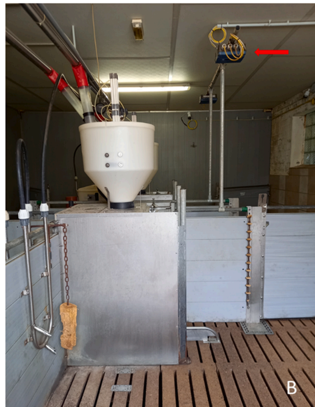
Fig. 1. (A) Illustration of the pen for fattening pigs on Farm 1. The single-space electronic feeding station is represented by the white rectangle, the iDOL65 3D camera by the white pentagon, the crude fibre station by the white circle, drinking cups by the black hollow circles, and the two solid black squares give the location of enrichment, which differed between pens. Half the pens were in the opposite configuration (feeder always located next to the door/corridor). (B) Illustration of the pen with the depth camera installed above the individual feeding station and indicated by the red arrow (credit: Jacinta D. Bus).

was recalibrated. On Farm 2, no camera cleaning or recalibration was performed. On Farm 1, the feeding station's construction was developed for only one pig to eat, and consequently be registered by the RFID system, at a time. On Farm 2, the RFID was configured to randomly switch between the three partitions and read once every second, hence each position could only be read once every 2 s. The camera took a 3D image at a 10-s interval on Farm 1 at individual and pen level, and on Farm 2 at pen level. On Farm 2, at individual level, the camera took a 3D image every 1 s.