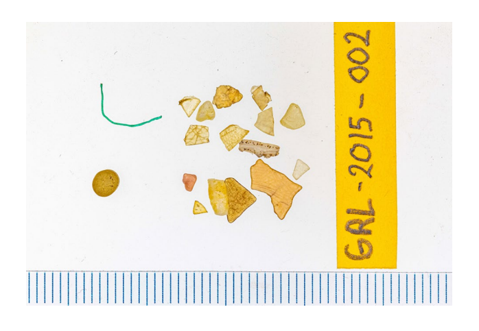
Fig. 2 Stomach content of fulmar GRL-2015-002, a double light coloured adult breeding female with plastics just under the 0.1 g used in the target definition of ecological quality or good environmental status. The stomach contained 17 plastic particles weighing 0.0911 g. According to the EcoQO, 10% of stomachs may contain more plastic than in this example; the other 90% may still have plastic in the stomach, but not more than in this example

ingested plastic, we restricted data in Table 2 to more recent studies published after year 2010 that used data from mostly well after the year 2000. Thereby we largely avoid bias from temporal change as shown for previous decades in Van Franeker and Meijboom (2002), Van Franeker et al. (2011), and Van Franeker and Law (2015). Thus, early studies are not included in the table (Bourne 1976; Baltz and Morejohn 1976; Day et al. 1985; Furness 1985; Van Franeker 1985; Moser and Lee 1992; Robards et al. 1995; Blight and Burger 1997; Van Franeker and Meijboom 2002; Van Franeker et al. 2011). Regional coverage in new publications was sufficient to replace the older sources. Not all recent sources provided