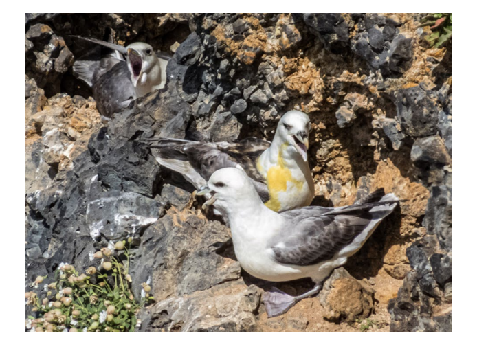
Fig. 4 The fouled fulmar on this photo had probably been spat on by its angry neighbour to the left in a dispute over the nest-site. The yellow colour of the oil indicates a fishy diet as crustacean diet usually leads to more orange colour of the oil (photo taken Iceland 3 July 2018 by Jan van Franeker)

gizzard prevents return of plastics once they have entered the gizzard (Ryan and Jackson 1986).