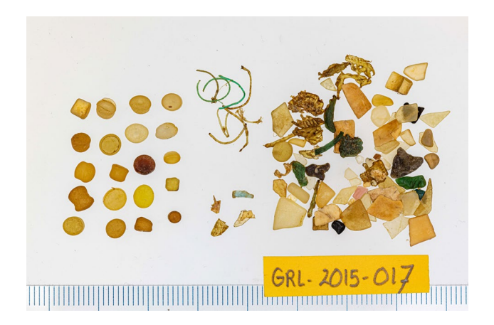
Fig. 1 Stomach content of fulmar GRL-2015-017, a coloured juvenile female that contained the highest plastic mass in our sample of 145 birds. Twenty industrial plastic pellets (left), 4 sheets (centre bottom), 8 threads (centre top) and 64 fragments (right) added up to 1.1505 g of plastic. The scale bar shows mm