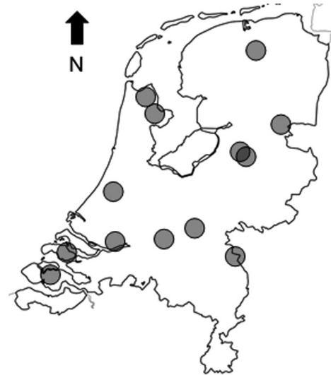
FIGURE 1 Distribution of the investigated hunting leases in the Netherlands with European hare ( Lepus europaeus ). The characteristics of hunting leases can be found in Appendix S1

Our paper investigates the correlations between the assumed influence of multiple predators and the body condition and fecundity of a mammal prey species in a field situation, which has been done only few times. We hypothesized that higher risk from multiple predators is related to higher stress levels, and lower prey body