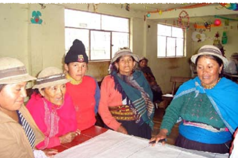
Farmers take nutritional needs into account when deciding what to grow.

Once we discovered the importance of working towards good food and focusing on the imperative for adequate quantity and health quality of food to prevent childhood malnutrition, the challenge became learning how to work together. Like many organisations, World Neighbors (WN) and its partners work through two central and interactive programme themes