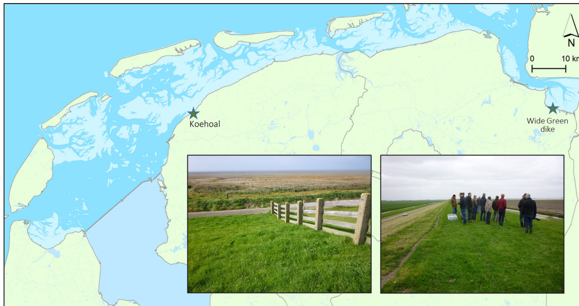
Fig. 3 Locations and pictures of the Mud Motor Koehoal (left) and Wide Green Dike (right) nature-based adaptation innovations along the Wadden Sea coast

by dikes. The Wadden Sea is a shallow sea, marked by barrier islands, sand and mud flats and coastal marshes (Reise et al. 2010). Due to its outstanding nature values the Wadden Sea has been listed as a UNESCO World Heritage site since 2009 (CWSS 2008; UNESCO 2009), and is protected by both national and international regulations for nature conservation. In 2010 a process commenced to search for suitable and sustainable adaptation strategies under future sea level rise (van Alphen 2016). Hybrid solutions that include the natural and semi-natural salt marshes along the Wadden Sea in dike design were seen as especially promising (Delta Programme 2014). These salt marshes function as a natural flood defence in front of the dike by damping incoming waves and reduce wave energy via friction with vegetation and the marsh surface (e.g. Anderson and Smith 2014). This has positive implications for the required dike dimensions (in particular slope and height) and the need for slope and toe protection structures (e.g. hard revetments and rocks) (Van Loon-Steensma 2015). Furthermore, natural and semi-natural salt marshes provide valuable habitat for characteristic salt-marsh vegetation (see e.g. Adam 1990), birds, fish and several invertebrate species (Bakker et al. 2005). Both our adaptations are large-scale nature-based flood protection innovations and focus on the development of salt-marsh foreshores and natural processes in view of future flood protection.