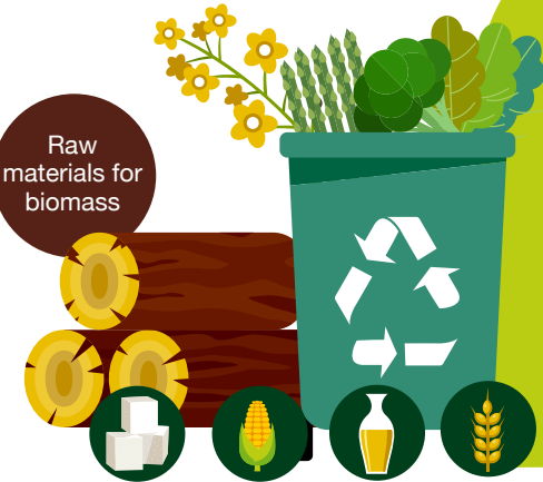
Raw materials for biomass