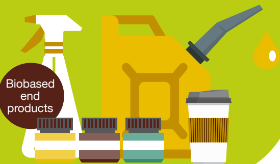
Biobased end products