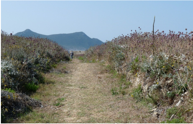
Figure 5. Allium commutatum Guss (TK076; Methoni Castle, Peloponnese) in its natural habitat.