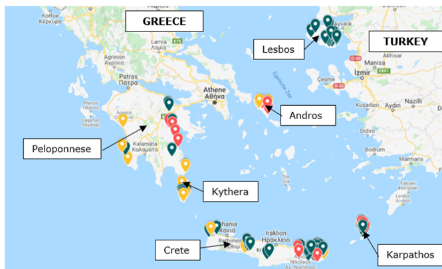
Figure 1. Overview of the collecting sites of the leek CWR collecting mission 2009. The blue, yellow and red dots indicate Allium ampeloprasum , A. commutatum and A. bourgeaui , respectively. For collecting site details: https://www.wur.nl/en/Research-Results/Statutory-research-tasks/Centre-for-Genetic-Resources-the-Netherlands-1/Genebank/Special-collections.htm

per population were randomly collected and bulked in a linen bag. In almost all cases, the seed was not visible from the outside. Therefore, the quality of the seed was inspected by opening the green fruit capsule (ovary) manually and by checking if the seed was black or white. If fruit capsules in a number of inflorescences contained black (mature) seed, a seed sample was taken. The populations collected at the southeastern coast of Crete always had black seeds as in this part of Greece summer and high temperatures arrive early. Together with the inflorescence, 15-20 cm of the flower stalk was also collected to provide the maturing seeds with nutrients. If the seeds were still translucent/white, 5-10 bulblets (small bulbs inside the foliage leaves of the storage bulbs; not to be confused with bulbils which are present in the inflorescence) were collected per plant. In a few cases bulbs were also collected.