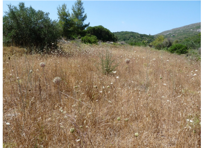
Figure 2. Allium ampeloprasum L. (TK072; Mylopotamos, Kythera) in its natural habitat.