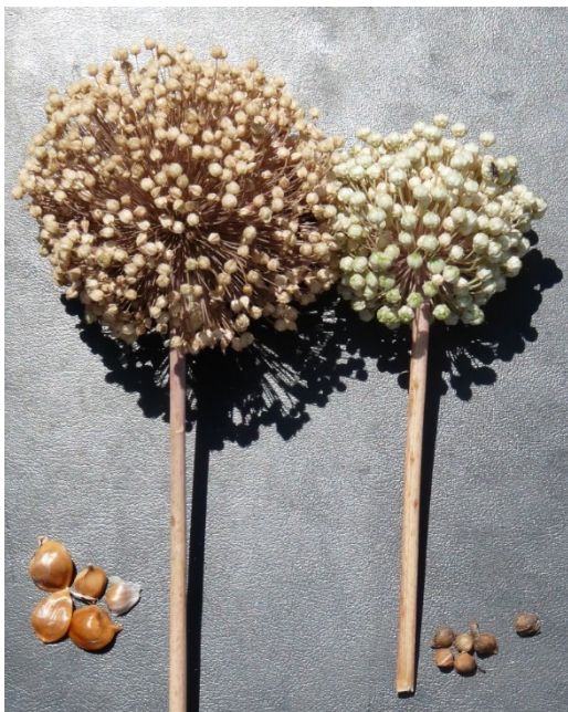
Figure 3. The two Allium ampeloprasum types differ in their mode of reproduction. Inflorescences and bulblets of both types are shown. On the left the asexual type (type II) and on the right the sexual type (type I).

The populations sampled consisted of 1-50 plants collected at altitudes ranging from 2 to 522 masl. According to Mathew (1996) A. bourgeaui comprises three subspecies, subsp. bourgeaui Rech.f., subsp. cycladicum Bothmer and subsp. creticum Bothmer. The three subspecies are distinguished from each other on the basis of the colour and shape of papillae of the perianth. As collecting took place when the flowering period was over and seeds had set, it was not possible to recognize the three subspecies on the basis of these traits. Identification of the three subspecies is nevertheless possible as the three subspecies have a distinct and scarcely overlapping distribution pattern (Mathew, 1996). More precisely, sp. creticum can only be found in Crete (N=5 populations sampled), sp. bourgeaui only on the East Aegean islands of Rhodes, Karpathos and Kasos (N=6; Figure 4) and sp. cycladicum on Cyclades, Ikaria and the eastern part of the Greek mainland (N=9). The habitats in which these subspecies were found ranged from rocky gorges and steep hillsides to more accessible locations like field borders and hillsides along roads.