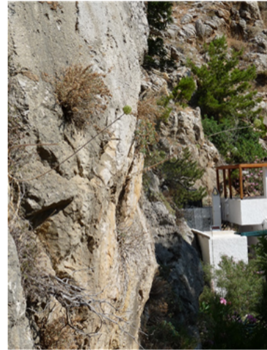
Figure 4. Allium bourgeaui ssp. bourgeaui Rech.f. (TK012; Achata beach, Karpathos) in its natural habitat.