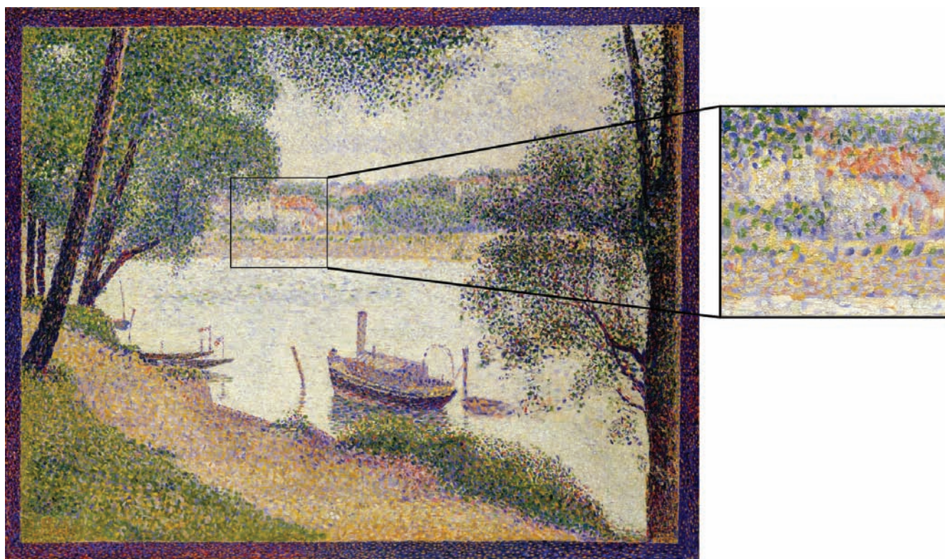
Figure 3. Gray Weather, Grande Jatte , ca 1886–1888, by Georges Seurat, The Metropolitan Museum of Art . Zooming in on details only reveals bundles of small dots of different colors. The full picture only appears when observing from a distance. Image: Peter Barritt / Alamy Stock Photo, modified by the authors.

insulation, lighting, appliances, and building design, generate cost savings from lower energy bills and make sense strictly from a private financial perspective independent of climate or other environmental benefits. In the United States, investments in energy efficiency of about $520 billion have been estimated to generate savings of $1.2 trillion (Granade et al. 2009: vii), more than paying for themselves, even without consideration of environmental benefits. In addition, reducing energy use would also improve air quality, generating large public health benefits. For example, the National Research Council estimated that air pollution damages from coal-fired electricity production in 2005 was $62 billion (NRC 2010). Rather than trying to resolve the many uncertainties we face, we can instead focus on identifying key policy relevant issues that could change the policy choice.