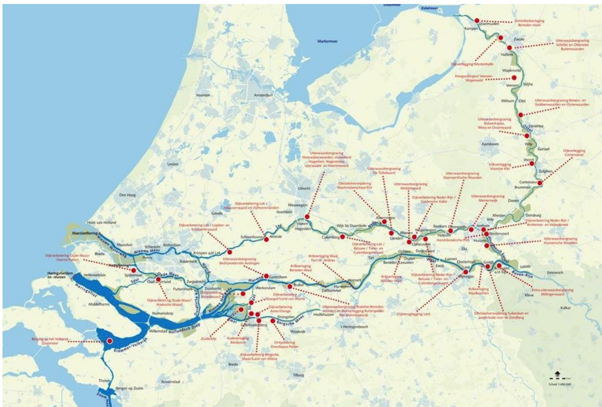
Figure 2. The 39 measures implemented

To cope with the objectives 39 measures were selected to lower the flood level of the River Rhine and its branches in the Netherlands (figure 2). The 'Planning Kit' was used to select the 39 measures. This tool consists of a collection of (hydraulic) model results and an estimate of costs and compared various measures. It was used to take well informed decisions. The 39 measures should enhance spatial quality ( Klijn et al, 2012 ). In order to meet this goal an interdisciplinary Quality Team (Q-team Room for the River) was installed. This Q-team was commissioned to coach planners and designers, to peer review the designs and plans on spatial quality ( Klijn et al, 2013 ). The final implementation of the measures was decentralized to local or regional authorities (like water boards), sometimes partly to private parties.