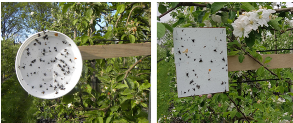
Figure 1. Round plate (treatment E) and the same material attached on a rectangular board (treatment D). Both traps have the same surface (300 cm 2 ).

Effect of mass trapping on ASF infestation levels. The experiment was carried out in an organic orchard with apple cv. Topaz and Santana. Different densities of round disposable plates (as treatment E above) were deployed in plots of approximately 1000 m 2 . Treatments were: 1) no traps; 2) 555 traps per ha (one trap every six meter in a row) and 3) 1111 traps per ha (one trap every 3 meter in a row). Traps were attached to the tree poles at 1.6-1.8 m high, alternately facing south or west. Insect glue was sprayed on one side of the plates one week before bloom. Just after bloom ASF damage was quantified by counting the number of flowers with oviposition marks. One month later, the number of fruits with ASF larval tunnels was counted. The trial had a randomised complete block design with 5 replicates.