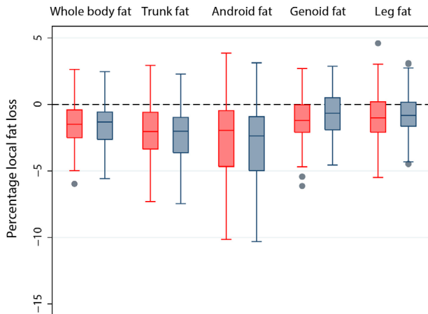
Figure 2. Change in local fat percentage in the whole body, trunk, android, gynoid, and leg area after the intervention, stratified for gender. Red: women; Gray: men. The lower and upper boundary of the boxes indicate the interquartile distance (IQR) (the 25th and 75th percentile). The line within the box is the median. The lower whisker indicates the lower adjacent value; the upper whisker indicates the higher adjacent value. Gray dots are individual outliers indicating values that are more than 1.5 times the IQR.

circulating metabolic biomarkers. Since the lower body fat measures themselves do not show any association with metabolic biomarkers, the latter association seems to be driven by the whole body fat measure. Hence, after adjustment for BMI, we observed that a higher percentage of fat in the trunk or android body regions (abdominal fat) associated with a lower concentration of lipids in (extra) large HDL particles and smaller HDL diameter, a higher concentration of lipids in (extra) large VLDL particles, and higher circulating levels of leucine, isoleucine, serum triglycerides, glycoprotein acetyls, 3-hydroxybutyrate, and glycerol.