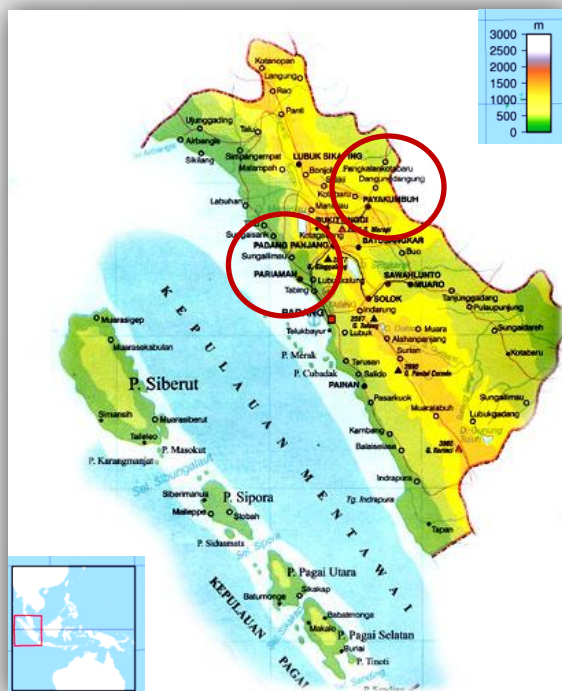
Figure 1. Map of sampling location

The West Sumatra Island has a varied terrain, which is divided into upland and lowland categories generally. There are potential fields as dairy goat farming intensification based on the sustainability of fodder sources. However, based on an author's survey as pre-observation conducted to several potential sites of the intensify goat farming, such as the Padang, Pariaman, Padang Pariaman regency, Bukittinggi, Solok, Solok regency, and Payakumbuh, it was known that the most serious problems faced by farmers was the provision of adequate feedstuffs in quantity and the both in terms of quality. Determination of the study area was consideration a significant difference in altitude of the location.