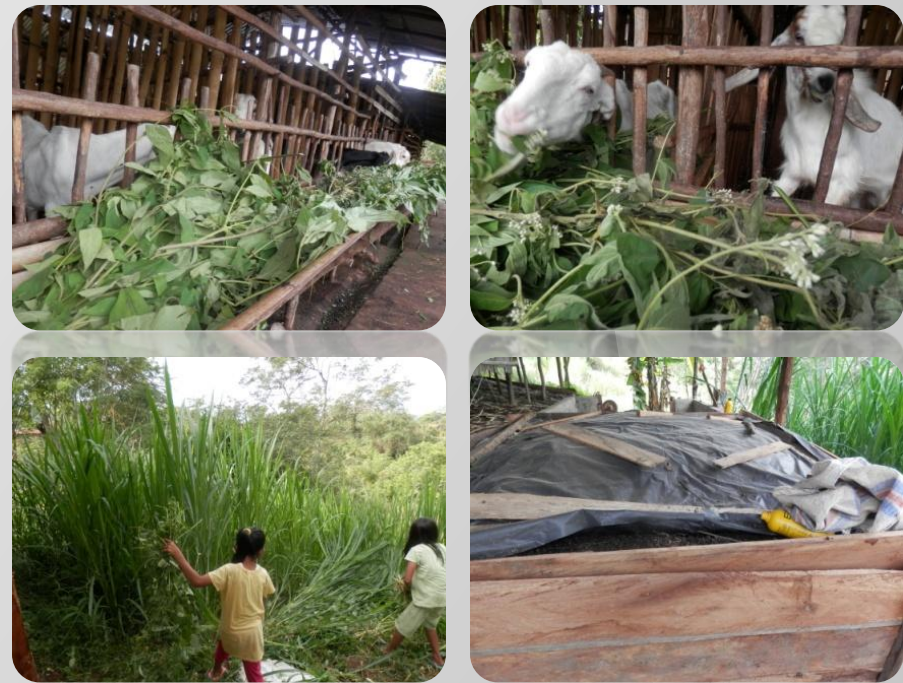
Figure 2. Performances of dairy goat farming

Both uplands and lowlands could be used as dairy goat farming intensively due to sustainability of feedstuffs in the entire area, but need improvement in housing systems and equipments.