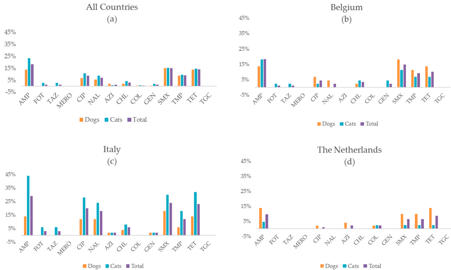
Figure 2. Antimicrobial resistance proportions (%) among Escherichia coli isolates from feces of dogs and cats in three European countries against a set of 14 antimicrobials. (a) Shown for all samples with a successful E. coli isolations from cats ( n = 137 ) and dogs ( n = 148 ); (b) E. coli from Belgian cats ( n = 44 ) and dogs ( n = 44 ); (c) E. coli from Italian cats ( n = 50 ) and dogs ( n = 50 ); (d) E. coli from Dutch cats ( n = 43 ) and dogs ( n = 51 ). AMP = ampicillin; FOT = cefotaxime; TAZ = ceftazidime; MERO = Meropenem; CIP = ciprofloxacin; NAL = nalidixic acid; AZI = azithromycin; CHL = chloramphenicol; COL = colistin; GEN = gentamicin; SMX = sulfamethoxazole; TMP = trimethoprim; TET = tetracycline; TGC = tigecycline. (Table S4).