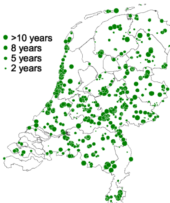
Figure 2. Distribution of the transects over The Netherlands. Dot size indicates the number of years a transect has been counted between 1990-2001.

These grasslands can be very rich in butterflies, both in numbers and in species. Characteristic species for this habitat type reaching high densities are Plebeius agestis , Polyommatus icarus , Papilio machaon (only in the south) and Issoria lathonia (mainly on dry grassland in the coastal dune area). Some of the common and widespread species reach