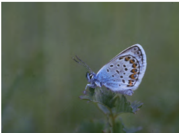
Figure 4. Plebeius argus is a characteristic species of heathlands.

Het heideblauwtje (Plebeius argus) is een kenmerkende vlinder van heide-terreinen.