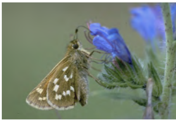
Figure 5. In The Netherlands Hesperia comma is restricted to dry heathland and open coastal dunes. In Nederland wordt de kommavlinder (Hesperia comma) uitsluitend gevonden op droge heidevelden en in de open kustduinen.

lineola can nowadays occur in high densities on heathlands.