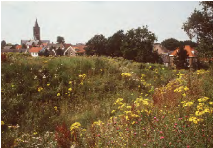
Figure 6. Densities of Maniola jurtina in this urban area in Naarden were very high.

De dichtheden van het bruin zandooige (Maniola jurtina) op de wallen van Naarden waren bijzonder hoog.