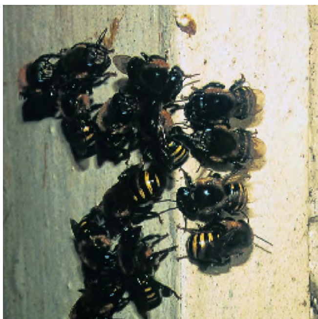
Figure 4. Workers interacting heavily at DCS4. Above a droplet of resin deposited by these workers with on top of this a part of a flower petal.

At all sites we found deposits of plant resin. We actually observed the deposition of plant material by workers at the incipient DCS4 when still very few males were present. Workers deposited plant resin and small parts of white flower petals on the substrate (figure 4). Beside these plant materials we also found mud ridges at the substrate of DCS1. The elaborate mud ridges resembled the typical mud ridges at the entrances of M. favosa nests. We did not observe the actual construction of these ridges but we conclude that they were made by workers since we have never observed drones working at such constructions.