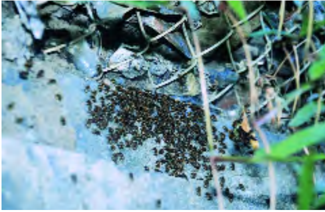
Figure 1. Position of DCS1 on a vertical concrete wall.

Positie van een darrenverzamelplaats (DCS1) op een betonnen muur.