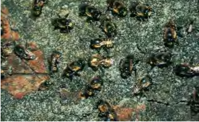
Figure 6. Marked drone soliciting for food from another drone. Een gemerkte dar bedelt om voedsel bij een andere dar.

vered with pollen indicated that they left to visit flowers. Now and then the whole group of males took off suddenly, without any perceivable reason. They sometimes remained hovering in a large cone-shaped group in front of, and orientated towards, the site. At other occasions the males disappeared from the site, to return again after a few minutes. Males also took off upon disturbance. The congregated males always flew up as soon as we collected or touched one of the drones for marking.