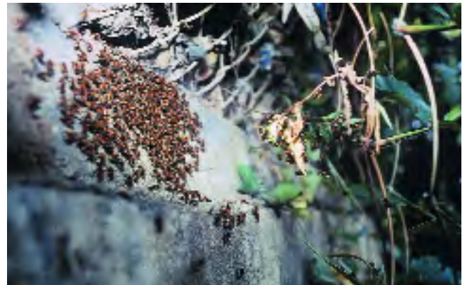
Figure 3. Fighting workers on the ground below the incipient DCS4. Left a killed worker.

Vechtende werkers op de grond onder de zich vormende DCS4. Links een gedode werkster.