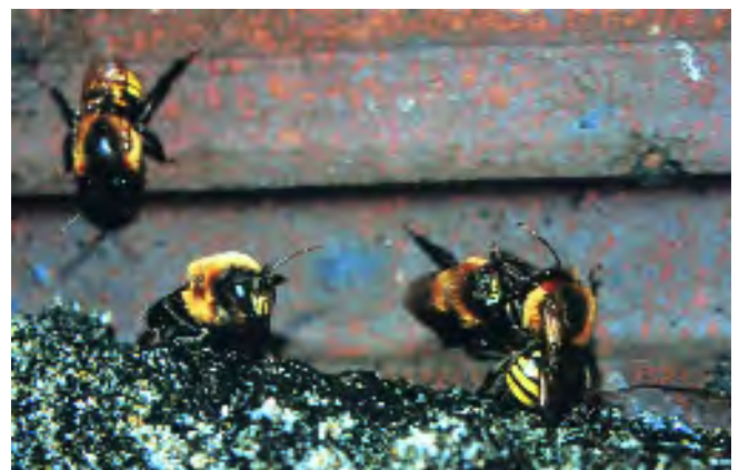
Figure 7. Aggressive food solicitation, in which the drone in the back solicits from the drone in the front. Left a drone with extended glossa and raised antennae. Agressief bedelen tussen darren (de achterste dar bedelt bij de voorste). Links een dar met uitgestoken tong en opgestoken antennen.

Bringing a cage with slightly pressed males near to congregating males resulted in the sudden flying of the congregation away from the cage. After three to five minutes the males returned. The repelling effect of molested males also appeared when a male was taken from a group of resting males.