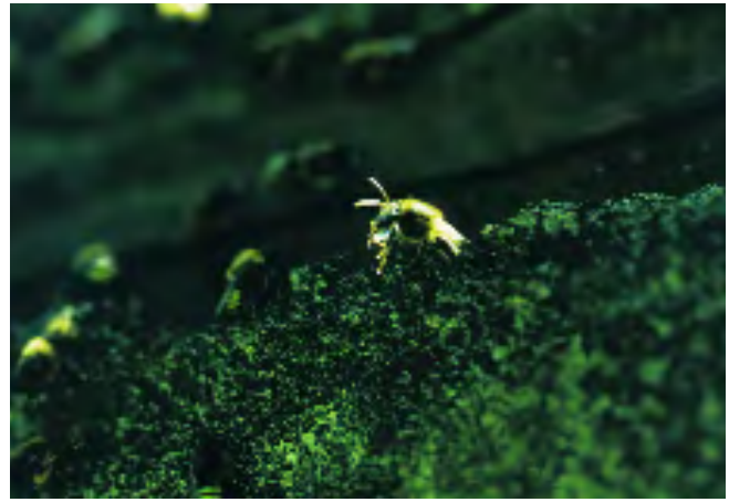
Figure 8. Drone dehydrating a droplet of honey stomach contents, expelled between his mandibles. This is a frequent behaviour of males at the DCS.

Lightly squeezed males in the cages of our experiments may simulate stressed males like those aggressively approached for trophallaxis. The chemicals emitted by molested males have a different effect compared to those emitted by molested workers. Scent released by stressed males attracts gynes, whereas worker scent attracts males. The prompt attraction of gynes to disturbed males illustrates the effectiveness of these male pheromones. The quick appearance of gynes also indicates that gynes are commonly present in the