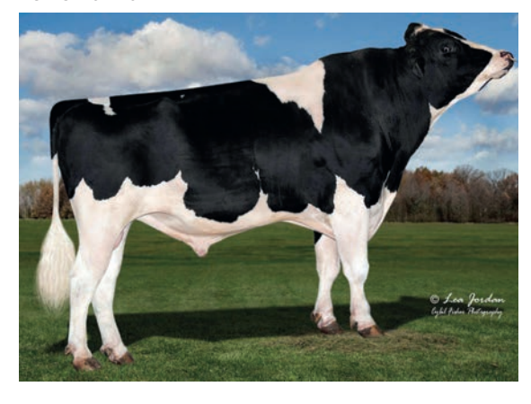
Bomaz Alta Topshot