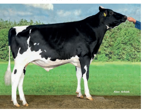
AOT Silver Helix