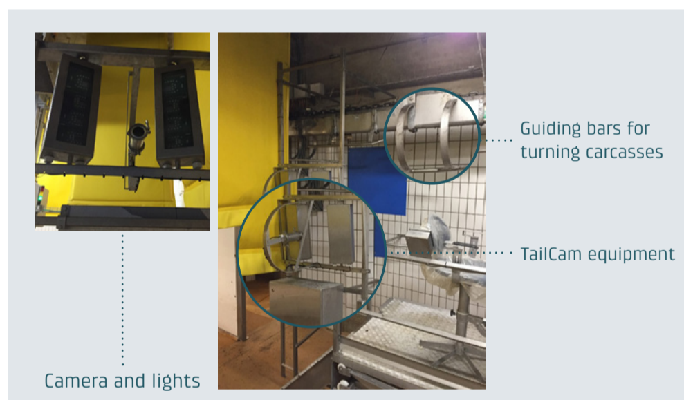
Figure 1: TailCam system.

The system can be seen in Fig. 1. Reference material was selected, and programming of algorithms was done by Convolutional Neural Network (CNN).