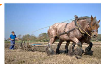
Dutch draft horses showing their original usage