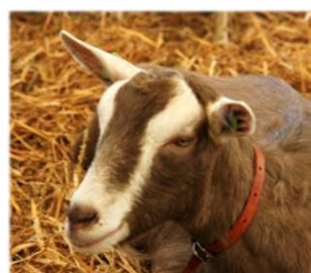
Dutch Toggenburger goats possess valuable genetic diversity