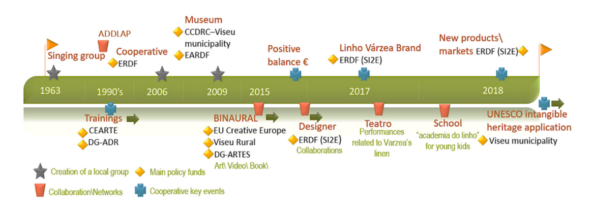
Figure 3. Timeline of developments around linen in Várzea.

The fieldwork sheds light on relevant policies and events that developed around linen in Várzea, which are summarized in Figure 3. We can see momentum quickly picking up after the museum's entry into the community in 2009 and an increase of supporting place-based policies. Many of the collaborations and new networks for linen have been revolving around the museum, which takes a dynamic and leader role in the development of sustainable place-shaping practices. Within the aim of facilitating rural development, ADDLAP and the Viseu municipality have acted as catalyzers for Várzea's development around linen.