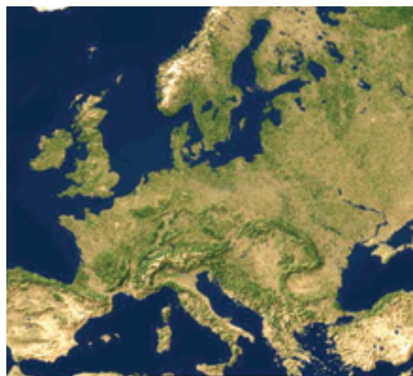
Fig 1: European soil resources. Soils and their different natural qualities are fundamental to land uses and functions in providing ecological services. European soils are under pressure by non-sustainable landuse practices. Understanding the varying properties of the soil (and water) systems in space and time that determine the opportunities for more eco-efficient land uses is essential for future integrated resource management policies.

Soils as a natural resource perform a number of key environmental, social and economic functions. Agriculture and forestry depend on soil for the supply of water and nutrients and for root fixation. Soils perform storage, filtering, buffering and transformation functions, thus playing a central role in the protection of water and the food chain and the exchange of gases with the atmosphere. Moreover, soil is a biological habitat, a gene pool, an element of the landscape and a cultural heritage as well as a provider of raw materials (see Fig. 1).