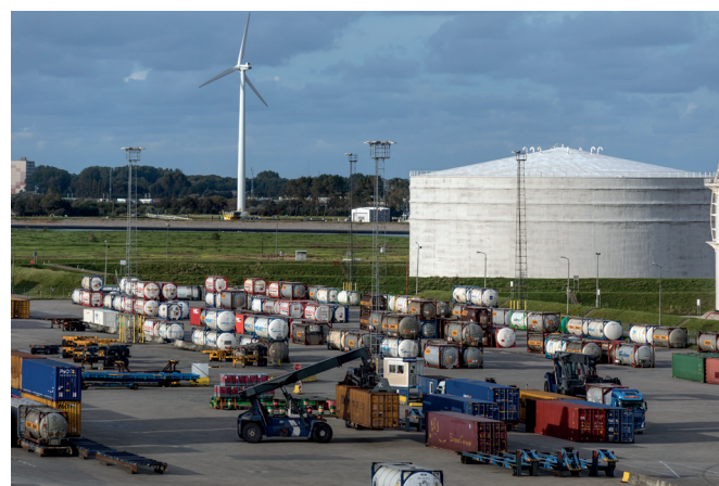
Chemical storage tanks and shipping containers at the Port of Rotterdam, Netherlands. The potential to reduce trade barriers may help harmonized systems for classifying and labelling chemicals to gain traction.

Governments and stakeholders with an interest in pursuing GHS implementation in their countries may also find it useful to build alliances with additional actors that may have interest in GHS implementation, such as trade unions and consumer organizations . We found that countries with a history of commitment to occupa-