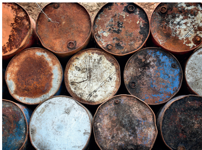
Lack of implementation of GHS is linked to low regulatory capacity and low GDP per capita.