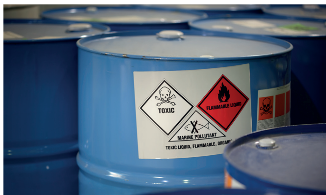
Labelling of chemical hazards varies widely within and among countries.

Building on this finding, any strategy to increase the GHS implementation should include efforts to strengthen the regulatory capacity of countries that have yet to put GHS aligned rules into effect . Particular areas of focus could include overall institutional strengthening of government agencies with responsibility for designing and implementing legislation for chemicals management across sectors. Steps could include, but not be limited to anti-corruption efforts and investments in capacity building of human resources at government agencies and offices with these regulatory functions. Examples from Zambia and Viet Nam, for instance, have shown positive results from long-term capacity-building support for the strengthening of national chemicals-management capacity. The work has aided GHS implementation, which has been carried out in both countries. Further exploration of the factors that have enabled low-income countries to progress with GHS implementation