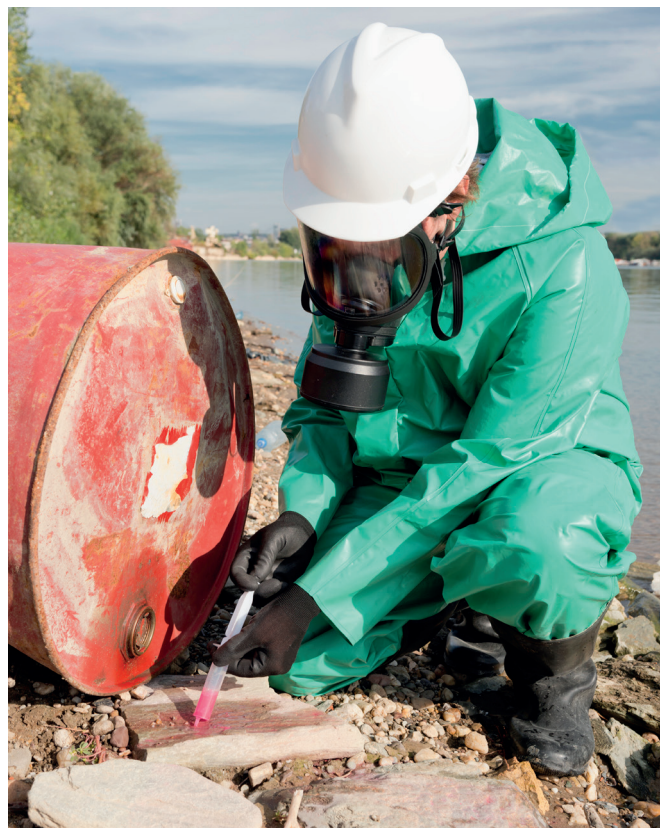
A worker samples the contents of a discarded drum. A worldwide system to harmonize the classifying and labelling of chemicals would help to ensure their safe use, transport, and disposal.

This policy brief examines how far countries have come in implementing the GHS in national legislation, and it ex-