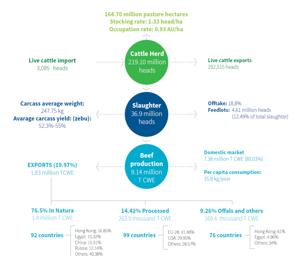
Figure 1. Brazilian beef sector's profile.

The terminology "livestock" is commonly used in Brazil to translate beef cattle to English. Therefore, we appropriated the same use of the terminology throughout this report. According to a study of 2016, Brazil has the largest herd in the world (13,8% of the global total) containing 219 million heads of cattle grazing/occupying 164.70 million hectares of pasture<sup>1</sup>. The central west part of Brazil (Mato Grosso, Rondonia and Pará) is the biggest beef producing region. Brazil imports only 3000 heads, mostly for breeding purposes, while exports 292.515 heads per year (see also figure 1).