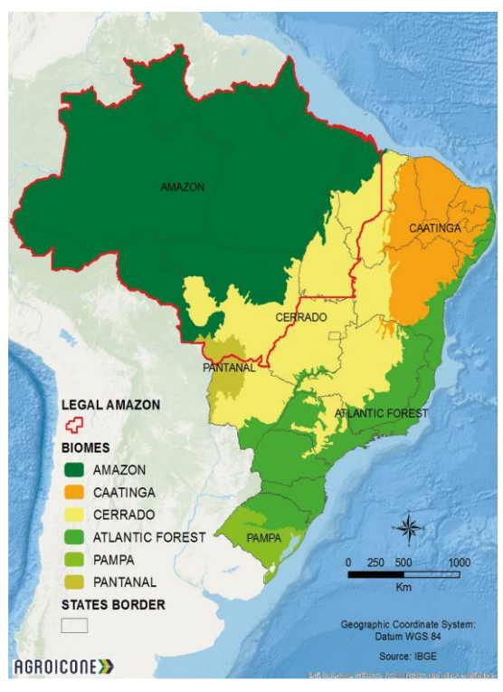
Figure 4. Brazilian map and Biomes.

<u>Carbon-neutral State of Mato Grosso do Sul</u> is an ambitious initiative on decarbonisation led by the state of Mato Grosso do Sul (MS) since 2016. MS is one of Brazil's largest agricultural and livestock producers and, together with <u>World Resources Institute (WRI) Brazil</u> and <u>Embrapa Beef Cattle</u>, the state have launched an overarching project to promote low-carbon development strategies. One of the main aims of the project is to reduce the methane emissions per unit of meat produced through a new brand-concept called "<u>Carbon Neutral Brazilian Beef</u> (CNBeef)." In addition, MS intends to deliver 15% of the country's overall goal to restore 15 million hectares of degraded pasture areas until 2020. In summary, the initiative not only helps MS shifting into a more sustainable pathway, but it also helps Brazil meeting its national and international climate goals to reduce its overall emissions (43% by 2030).