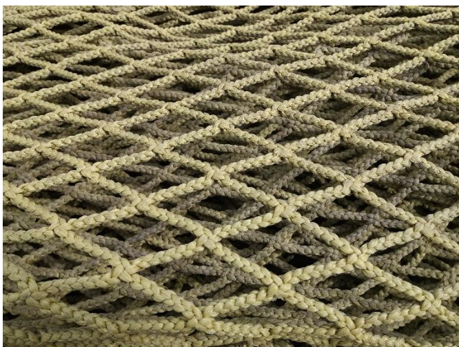
Knotless mesh-work

The effects of a knotless cod-end on the chances of survival of plaice and sole were tested during one fishing trip. In total, 59 plaice and 31 sole from the knotless cod-end were compared with 80 plaice and 33 sole from the conventional cod-end, respectively. The number of control fish was 33 plaice and 10 sole.