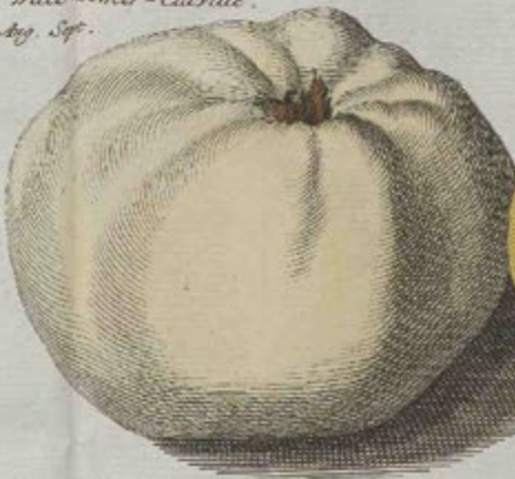
Cabrille blanche d'Été. Witte Semer-Cabrille. Aug. Sept.