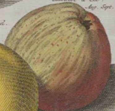
Semer Cuisinet d'Été. Aug. Sept.