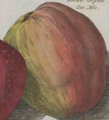
Rode Jopen. Oct. Nov.