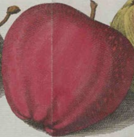
Cabrille rouge d'Été. Rode Semer-Cabrille. August. Sept.