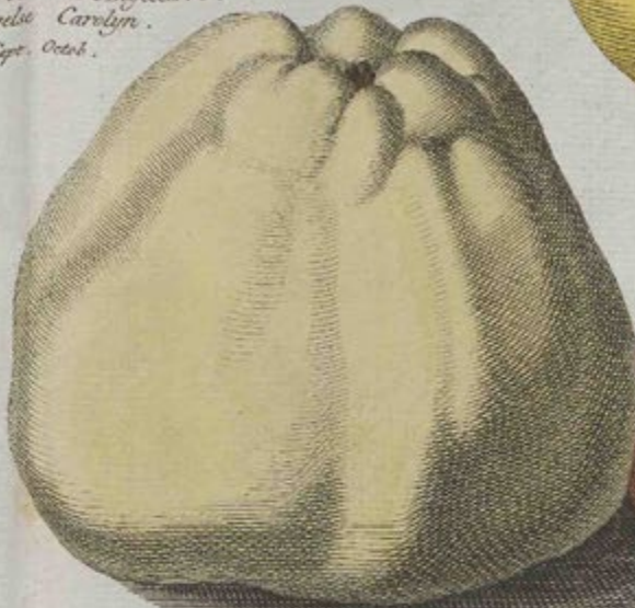
Caroline d'Angleterre. Engels Carolyn. Sept. Octob.