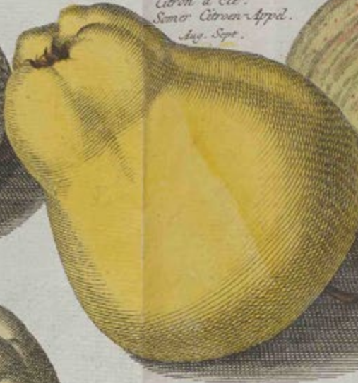
Citron d'Été. Semer Citron-Appel. Aug. Sept.