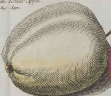
Witte Kruid-Appel. Aug. Sept.