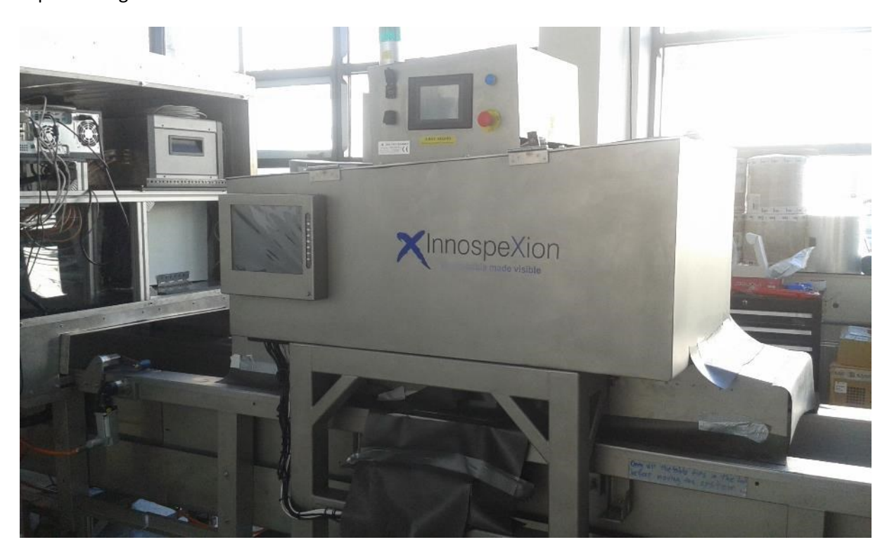
Figure 1. The X-ray sub-module in the PicknPack Line.

The X-ray module was designed and built by InnoS in collaboration with KUL and delivered to the food hall in WUR in January 2016. The module has since then been integrated into the line (Figure 1). More technical details on the X-ray setup can be found in deliverable report D4.6 and previous status reports are given in D4.10.