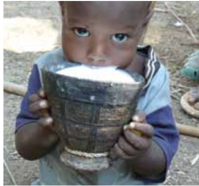
In an effort to cope with drought, Ethiopian nomads are growing vegetables (left), keeping camels for their milk (above right) and renovating their singing wells (below right).