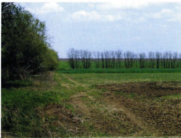
Fig. 1. Windbreaks (protective forest belts) in the agricultural landscape of the fescue/feather-grass steppe zone (near Nova Kakhovka, Kherson Province)

In the fescue/feather-grass steppe zone, windbreaks form a characteristic grid pattern, consisting of rows of trees, which intersect each other at right angles (Fig. 1). The nodes of the grid are spaced fairly regularly (about 1-3 km apart). In the wormwood/sod-grass steppe zone there are fewer forest belts, which are usually planted along major roads.