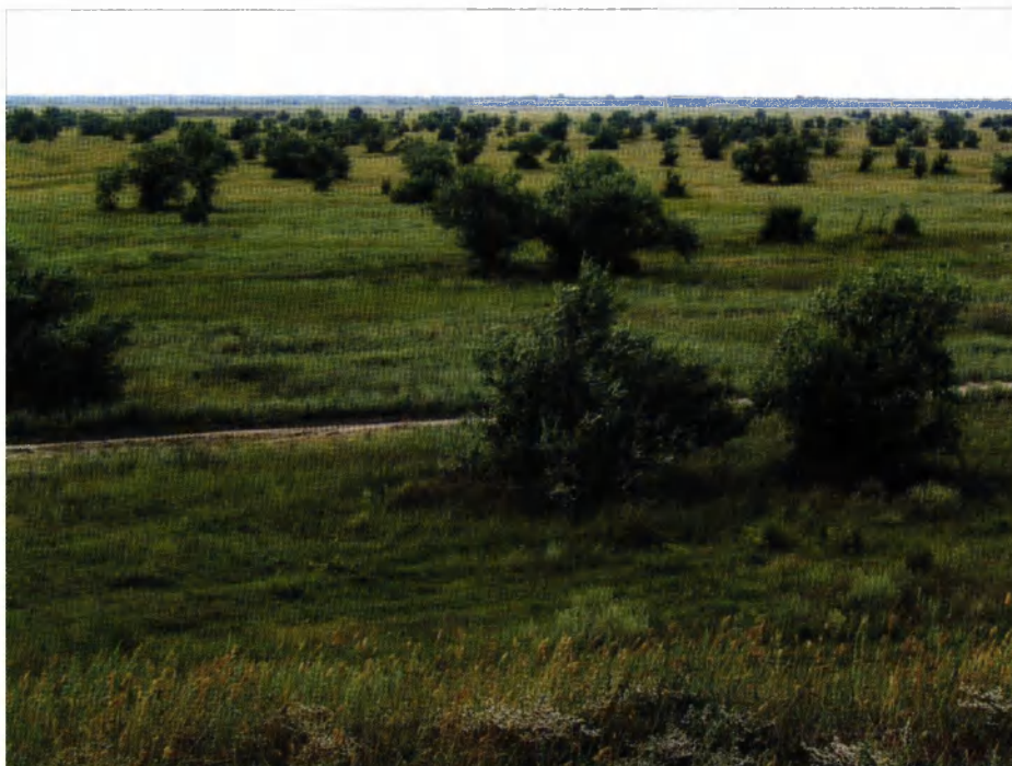
Fig. 4. Elaeagnus angustifolia on extensively used pastures in the wormwood/sod-grass steppe near the Black Sea Biosphere Reserve (Kherson Province)