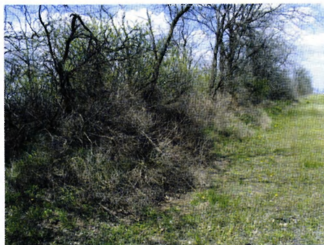
Fig. 2. Windbreaks as barriers to the tumbleweeds (near Nova Kakhovka, Kherson Province)

(ii) Local colonization of the bigger gaps in forest stands by steppe species. Some of the species are classified as hemi-apophytes (found in habitats slightly transformed by man). These include the following xero-