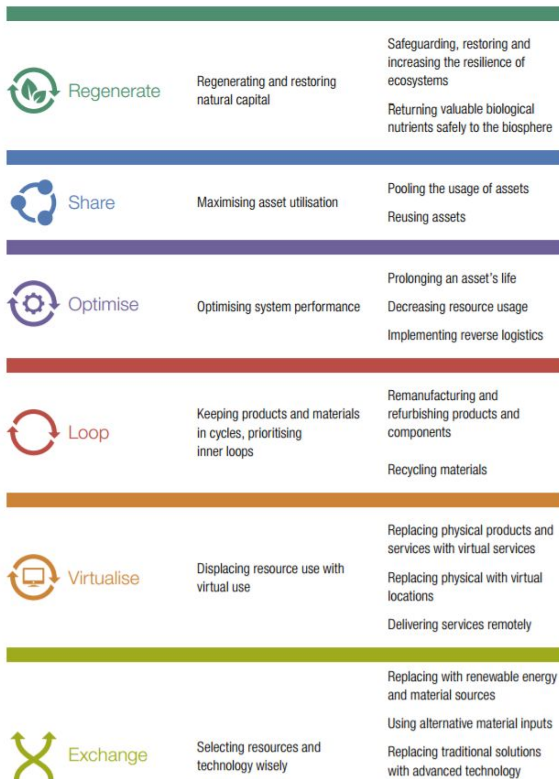
Figure 3: The ReSOLVE framework by the Ellen MacArthur Foundation.