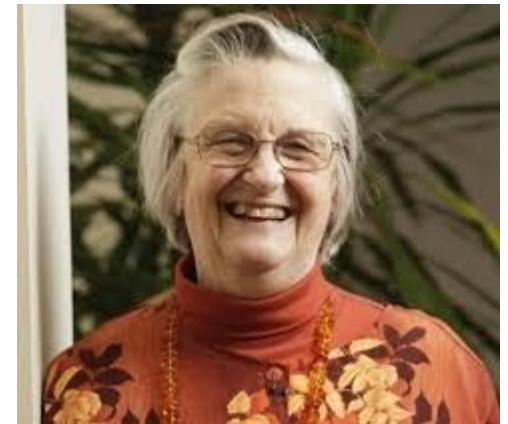
Elinor Ostrom: governing the commons