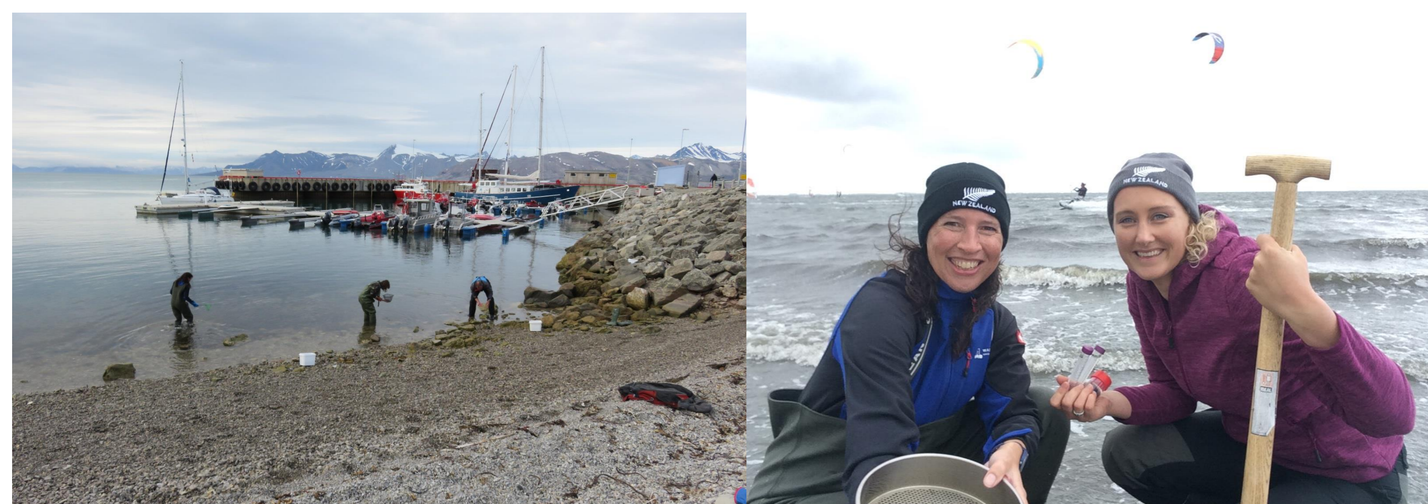
Figure 1. Specimen collection in Kongsfjorden, Svalbard, (left) and from origin locations of alien species in the Arctic (right: Oosterschelde, the Netherlands) for DNA barcoding.

32 Sediment samples were collected in the Kongsfjorden, Svalbard. These will be used to assess the presence of alien species en masse using a metabarcoding technique.