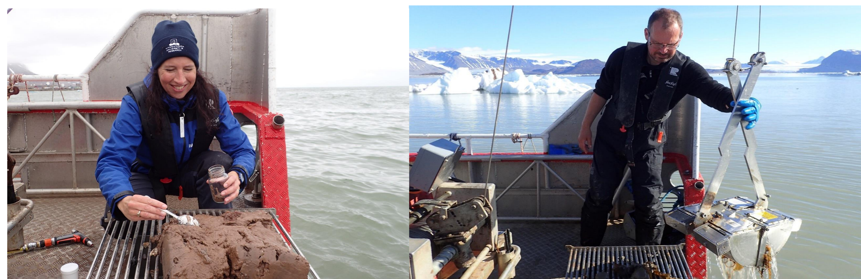
Figure 2. Collection of sediment samples in Kongsfjorden, Svalbard, for analysis of presence of alien species en masse .