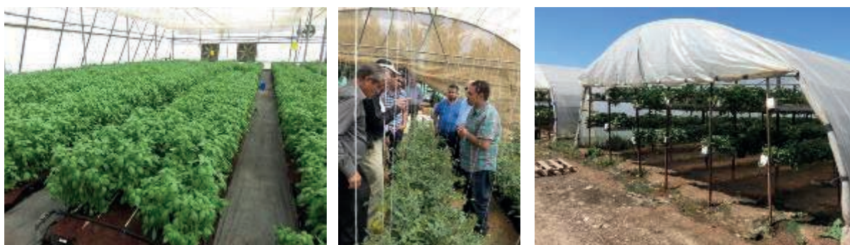
Figure 2 Left: basil in bed with solid substrate; middle: discussion at Al Nimer; right: strawberries in double layer system in coir.