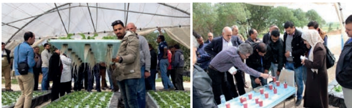
Figure 7 Practical explanation during the training sessions.

Most topics were easily absorbed by the group but the nutrient recipe and its use proved to be the most difficult part of the course. It was greatly appreciated that a web based tool was introduced which could help the users. Even so the concept of using a standard nutrient solution and then adapt this to a specific nutrient solution to stabilise the desired slab conditions was not properly mastered. Future lessons should have a separate session on the difference and connection between standard irrigation solution, standard slab solution, slab analysis and adapted irrigation solution. It is also advocated to use additional examples to make clear what the absence of proper analysis of drain and raw water can mean.