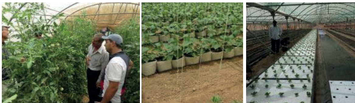
Figure 3 Al Nimr farm with mature tomato, young plants and lettuce on deep flow technique.