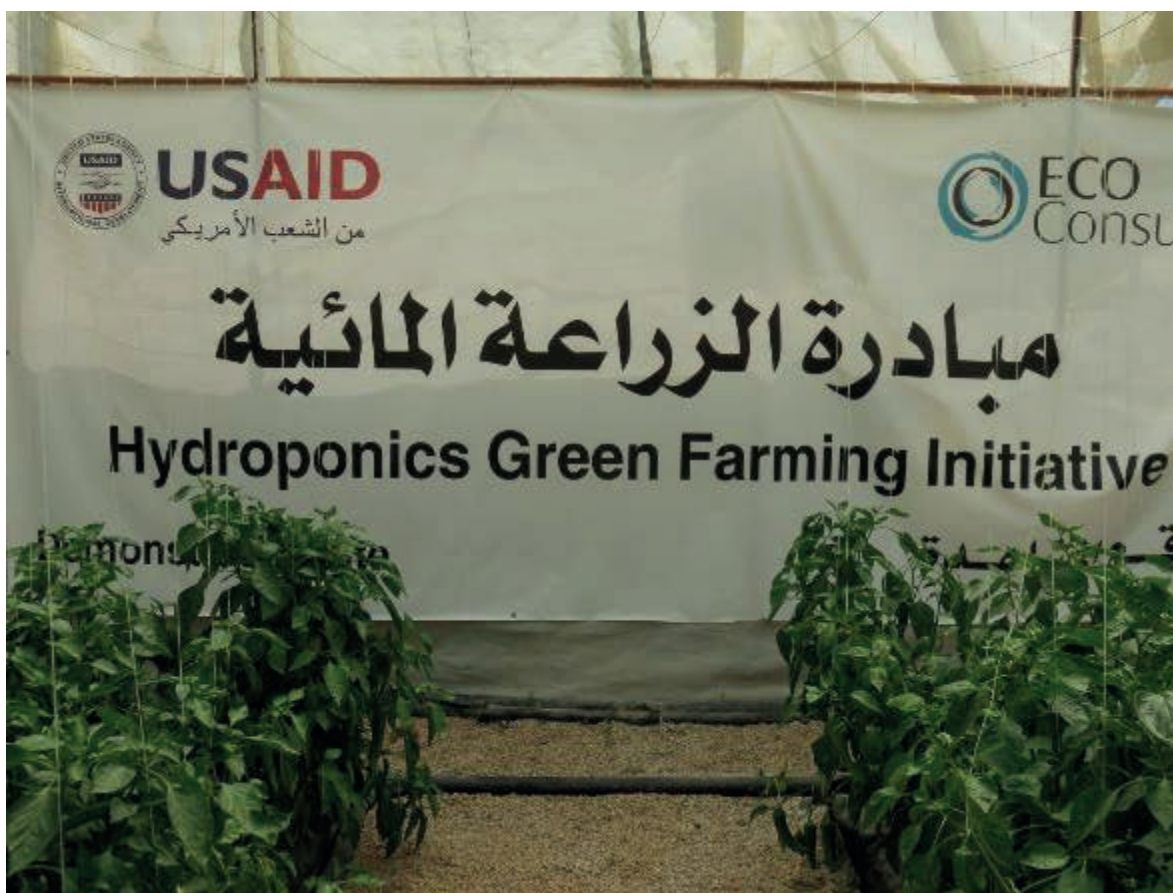
Figure 1 Banner of HGFI at one of the participating farms.

As an introduction to WUR specialists, all HGFI participating farms were visited during the first mission in May 2015. In addition, several other companies were visited, too. A wide diversity of crops was shown on hydroponics and in soil: tomato, sweet pepper, cucumber, lettuce, strawberry, basil and roses. For each farm improvements or adaptations were suggested and extensively discussed.