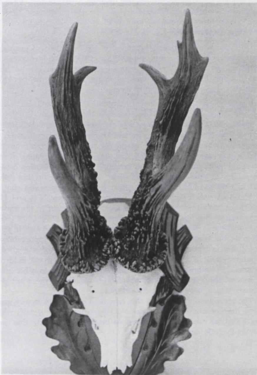
Fig. 2 - The best roe buck of the Noordoostpolder.