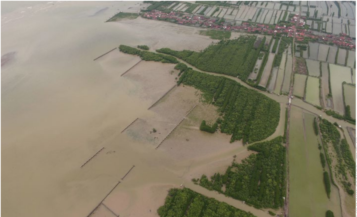
A drone photo of the mangrove restoration project on the north coast of Java near the city of Semarang. The semi-porous dams are visible in the water. They trap sediment, in which mangrove seeds can germinate.

Near the city of Semarang on the north coast of Central Java, history is repeating itself 1000 years later, as new salt marsh works get under way. 'We have copied the measurements of the dams directly from the salt marsh works as standardized by the Dutch national water board in 1900,' says Han Winterwerp of research institute Deltares. It is hands-on work, says the water specialist.