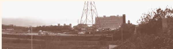
Industrial landscape near West Ham

Several specific problems need to be addressed before CPULs can be implemented more widely. These are similar to those encountered when planning for other large-scale urban infrastructure projects. Some of the main issues are: