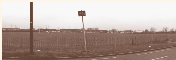
Open urban space in Daggenham.