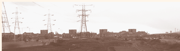
Pylon landscape near Choats Road.

Land ownership and the need for agreements to purchase or provide access to land. This can be extremely complex, and requires long-term spatial and acquisition policies. It is at this level of policy that a new single space planning body / authority, capable of interacting meaningfully with all stakeholders is required. Lessons can be learnt for governmental bodies and NGOs such as the UK-based sustainable transport organisation, Sustrans, which is independently developing an extensive cycle network across the country. Competing demands for land, not only from traditional developers / investors, but also from diverse interest groups such as sports organisations and environmental groups promoting wilderness areas. Building a consensus or linkages between these different stakeholders will be an important task.