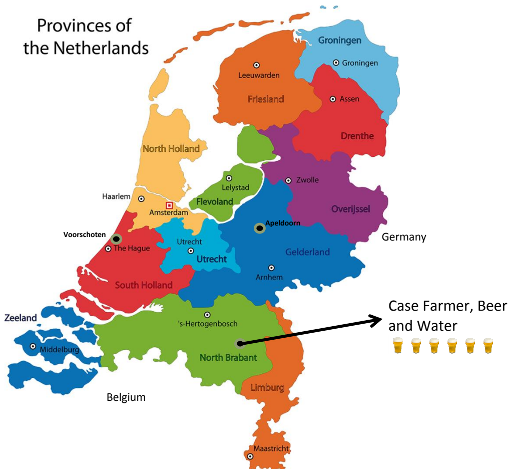
Figure 1 Location of the case Farmer, Beer and Water in the Netherlands.

The case Farmer, Beer and Water is located in the south of the Netherlands, in the province of North-Brabant (see Figure 1). It is a regional/local case dealing with local ground and surface water resources in the municipality of Laarbeek, and in particular in the catchment area of the small river Goorloop. The case concerns one brewery (Bavaria), a network of about 70 farmers, and other stakeholders like the regional water board, municipality, and the province of North-Brabant. In other areas in the Netherlands, there are comparable cases on the management of freshwater resources.